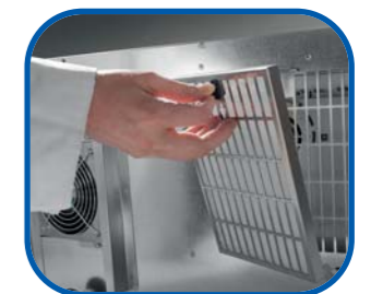
Easy to replace filter