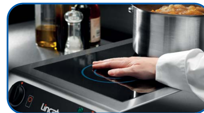
Surrounding hob surface remains at safe temperature