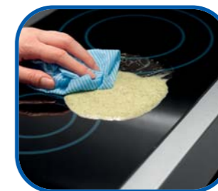
Easy to clean hob surface

Say goodbye to burned-on spills and splashes. Because the Lincat induction hob is not directly heated, any spills can simply be wiped off, keeping the surface hygienic and clean.