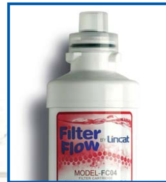
High capacity filter cartridge

The unique predictive eco mode learns from your usage and switches automatically to eco mode during quieter periods. Full operating capacity is restored when demand picks up.