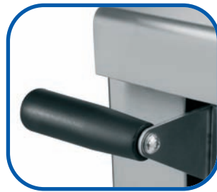
Reversible oven handle for optimum operational comfort