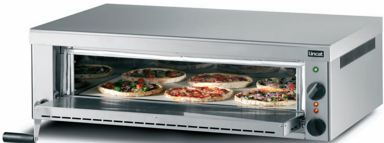
PO69X oven easily accommodates 6 x 9" (22cm) pizzas

Please refer to the separate "Pizza Equipment" brochure for details of Lincat's other pizza ovens, merchandisers and preparation station.