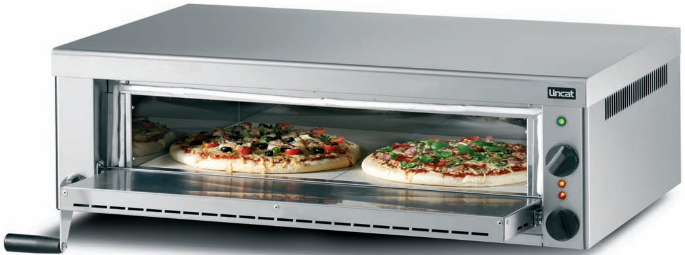
PO69X oven can accommodate 2 x 14" (35cm) pizzas