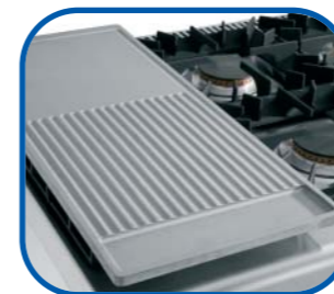
Optional drop-on griddle plate

Model codes ending with N or P: N = Natural Gas P = Propane Gas