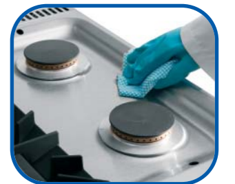
Easy clean hob