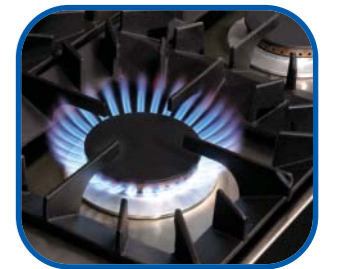
Powerful hob burners