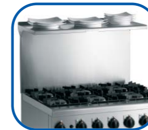
Optional splashback/plate shelf