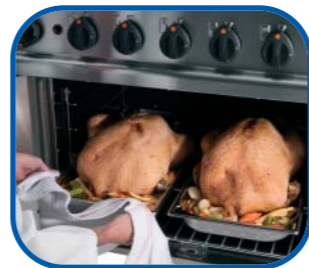
Large oven easily accommodates two 25lb turkeys