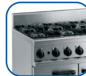
Optional flue extension