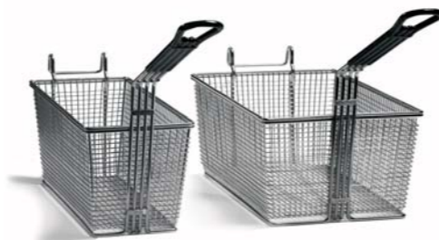
Heavy-duty spun wire, nickel plated baskets