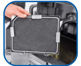
Premium carbon pad filter removes contaminants and particles as fine as 0.5 microns (0.0005mm)