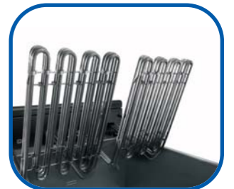
Lift-and-park hinged elements